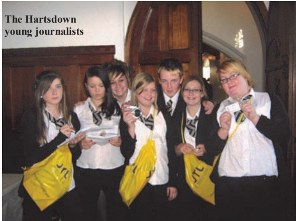
The Hartsdown young journalists

them questions about what their career choices would be when they leave school.'